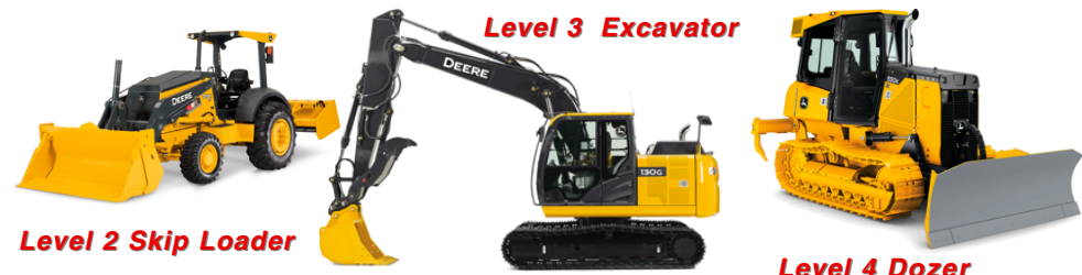
Level 2 Skip Loader