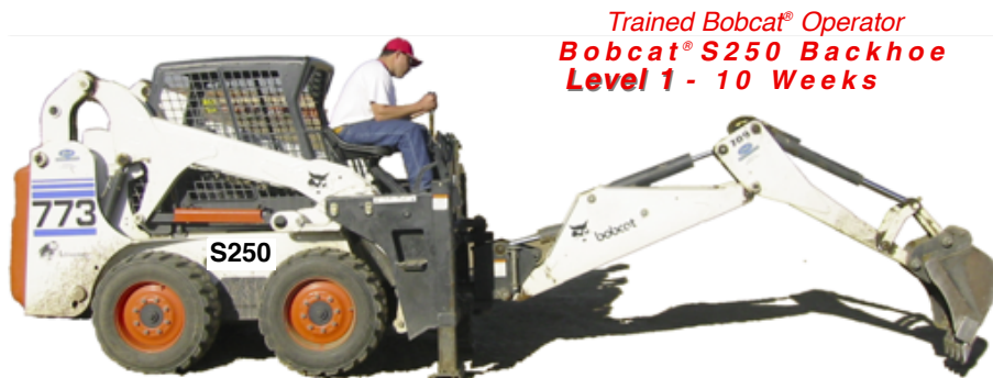
Trained Bobcat® Operator Bobcat® S250 Backhoe Level 1 - 10 Weeks

The College of Instrument Technology recommends that students have personal accident or medical insurance. If student does not have insurance, the student should contact his/her local insurance agent to purchase insurance.