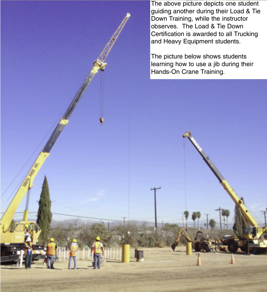
The picture below shows students learning how to use a jib during their Hands-On Crane Training.