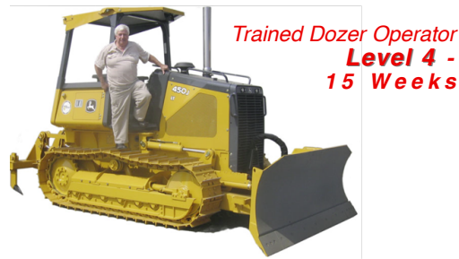
Trained Dozer Operator Level 4 - 15 Weeks

Federal Truth in Lending Act pursuant to Title 15 of the United States Code. If a student obtains a loan to pay for an educational program, the student will have the responsibility to repay the full amount of the loan plus interest, less the amount of any refund, and that, if the student has received federal student financial aid funds, the student is entitled to a refund of the moneys not paid from federal student financial aid program funds.