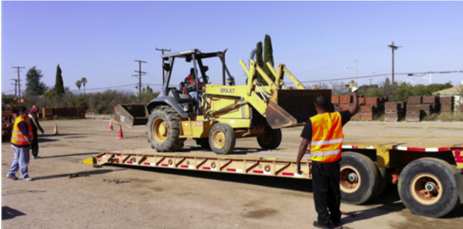
The above picture depicts one student guiding another during their Load & Tie Down Training, while the instructor observes. The Load & Tie Down Certification is awarded to all Trucking and Heavy Equipment students.