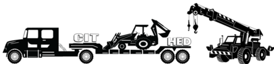
College of Instrument Technology / Heavy Equipment Driver

CIT has had over an 85% school-wide job placement rate for over 15 years; CIT implements a very strategic curriculum, which enables students to timely gain the skillset they need to obtain a lifelong career.