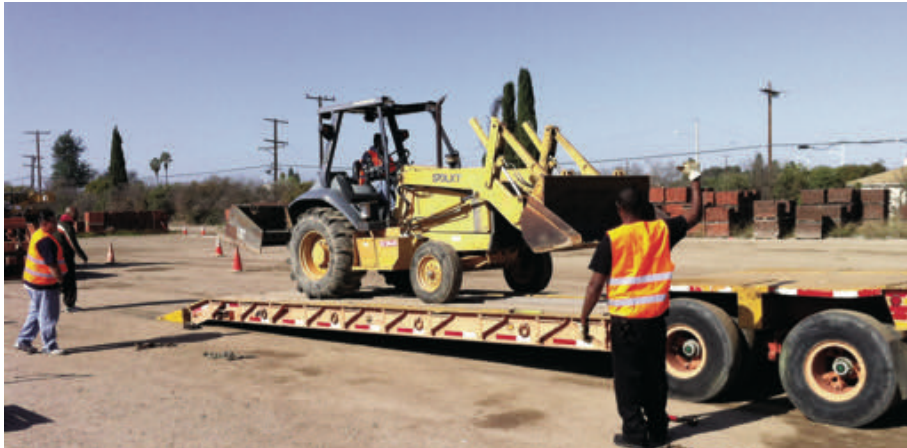
The above picture depicts one student guiding another during their Load & Tie Down Training, while the instructor observes. The Load & Tie Down Certification is awarded to all Trucking and Heavy Equipment students.