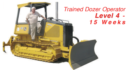
Trained Dozer Operator Level 4 - 15 Weeks

Federal Truth in Lending Act pursuant to Title 15 of the United States Code. If a student obtains a loan to pay for an educational program, the student will have the responsibility to repay the full amount of the loan plus interest, less the amount of any refund, and that, if the student has received federal student financial aid funds, the student is entitled to a refund of the moneys not paid from federal student financial aid program funds.