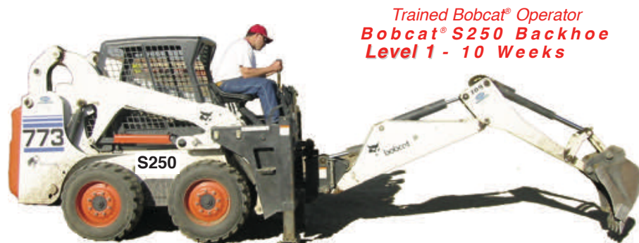
Trained Bobcat® Operator Bobcat® S250 Backhoe Level 1 - 10 Weeks

The College of Instrument Technology recommends that students have personal accident or medical insurance. If student does not have insurance, the student should contact his/her local insurance agent to purchase insurance.