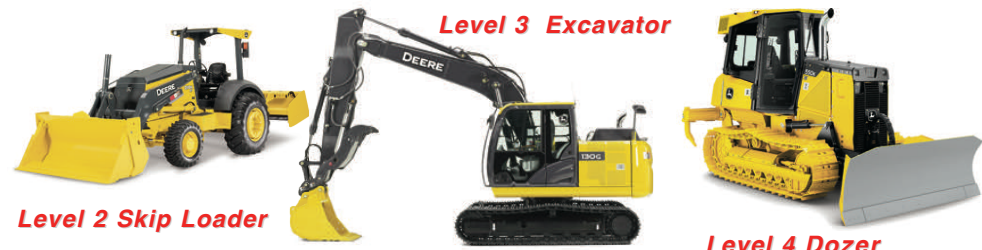
Level 2 Skip Loader