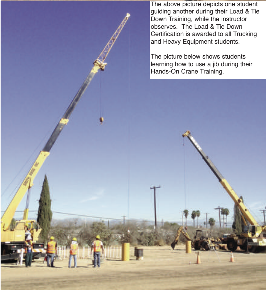
The picture below shows students learning how to use a jib during their Hands-On Crane Training.