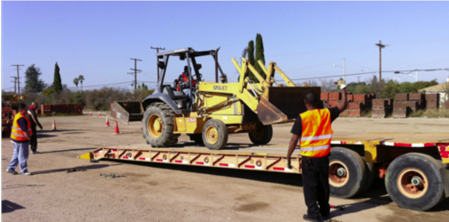
The above picture depicts one student guiding another during their Load & Tie Down Training, while the instructor observes. The Load & Tie Down Certification is awarded to all Trucking and Heavy Equipment students.