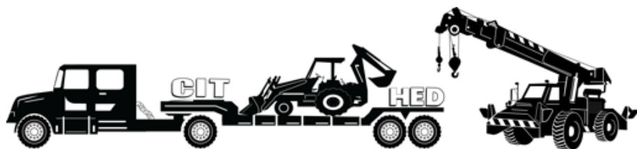
College of Instrument Technology / Heavy Equipment Driver

CIT has had over an 85% school-wide job placement rate for over 15 years; CIT implements a very strategic curriculum, which enables students to timely gain the skillset they need to obtain a lifelong career.