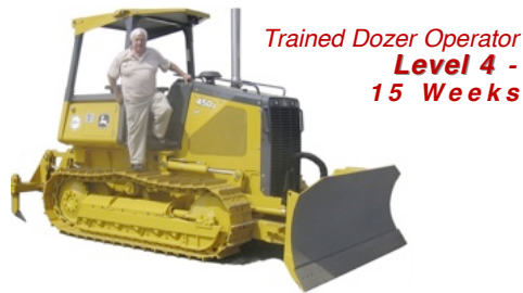
Trained Dozer Operator Level 4 - 15 Weeks

Federal Truth in Lending Act pursuant to Title 15 of the United States Code. If a student obtains a loan to pay for an educational program, the student will have the responsibility to repay the full amount of the loan plus interest, less the amount of any refund, and that, if the student has received federal student financial aid funds, the student is entitled to a refund of the moneys not paid from federal student financial aid program funds.