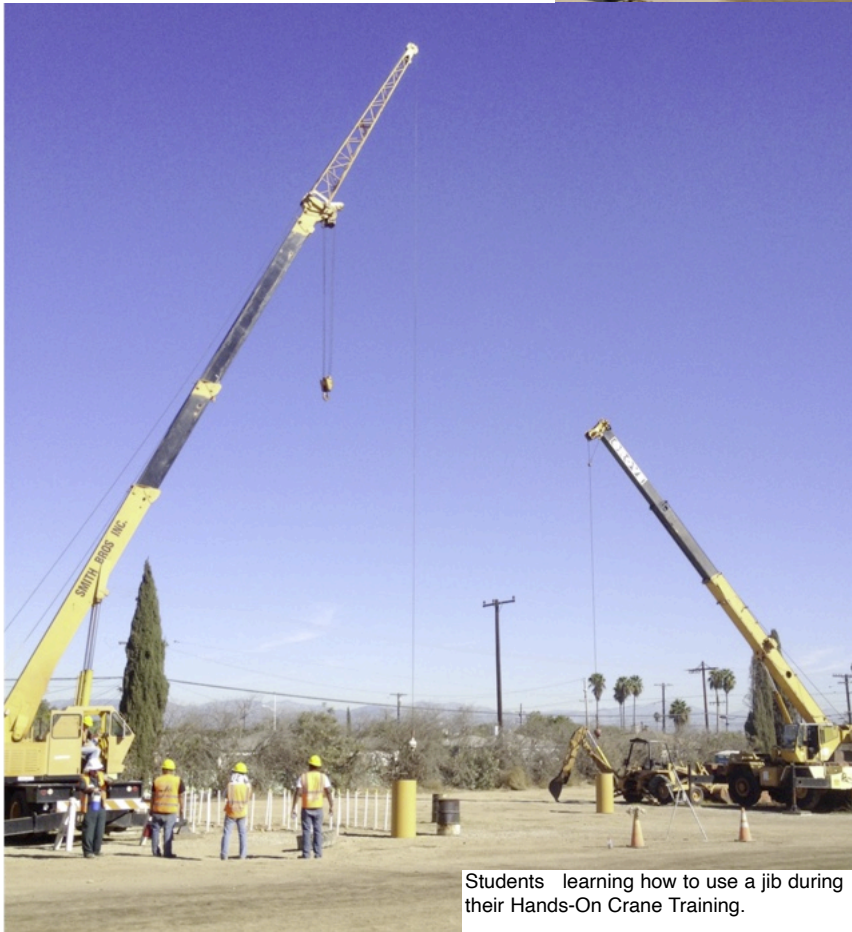
Students learning how to use a jib during their Hands-On Crane Training.