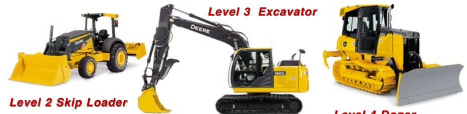
Level 2 Skip Loader