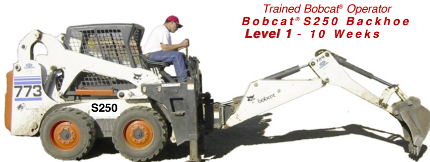
Trained Bobcat® Operator Bobcat® S250 Backhoe Level 1 - 10 Weeks

The College of Instrument Technology recommends that students have personal accident or medical insurance. If a student does not have insurance, the student should contact his/her local insurance agent to purchase insurance.